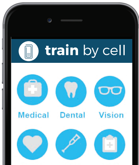
Mobile Web Authoring/ Publishing Platform